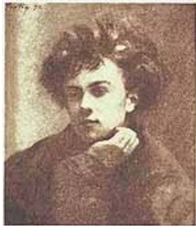
Sketch by Fantin-Latour, 1872

A holy vagabond, a beautiful reckless genius child for whom art could only proceed from a complete derangement of the senses and who was as much voyou as voyant , 1 Arthur Rimbaud (1854-1891)